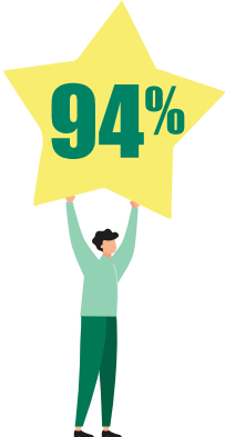
94% of customers say it is very important or important that they trust the customer service of an organisation they are dealing with