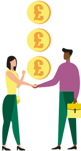
34% of people will pay more for excellent customer service