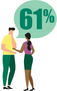
61% of the workforce are in customer facing roles