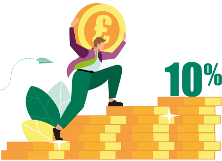
10 percentage points higher profitability where customer satisfaction is above sector average