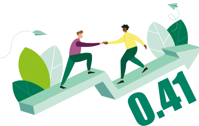
0.41 increase in customer satisfaction for every 1 point of employee engagement