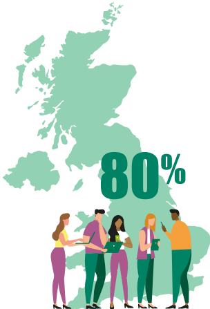
80% UK GDP from the service sector