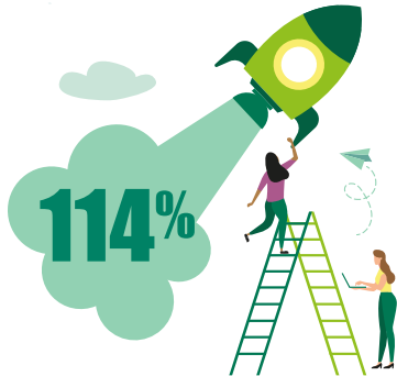
114% higher revenue per employee for organisations with higher than sector average UKCSI