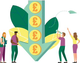
£128bn lost to the economy each year through poor customer service