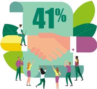
41% of customers agree that customer service strongly influences their trust in an organisation