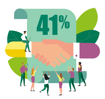
41% of customers agree that customer service strongly influences their trust in an organisation