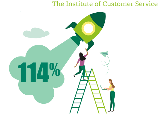
114% higher revenue per employee for organisations with higher than sector average UKCSI